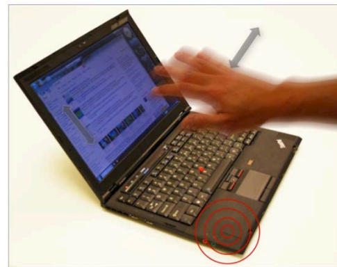
Figure 1: SoundWave allows non-contact, real time in-air gesture sensing on existing commodity computing devices.

Copyright 2012 ACM 978-1-4503-1015-4/12/05...$10.00.